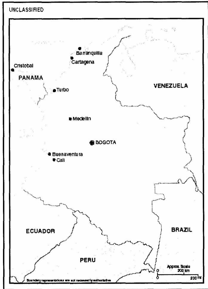
AUC Ties to Equipos Y Repuestos