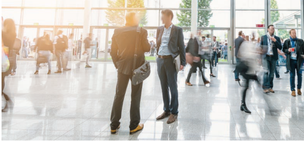
LEFT: Overt collectors discuss latest technology.