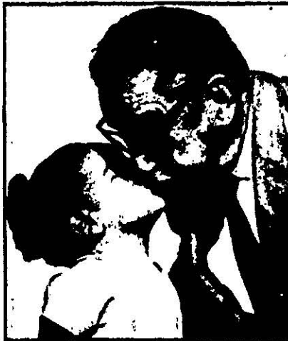
MARSHAL (RET) ARTHUR DA COSTA E SILVA