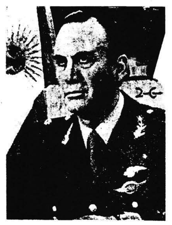
Page determined to be Unclassified Reviewed DIA FOIA & Declassification Services Offices IAW EO 13526, Section 3.5 Date: Oct 17, 2018