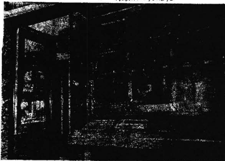
Considerables danos en su frente y en el interior causó el atentado perpetrado contra la agencia Belgrano de LA NACION, ubicada en Jaramiento 2374. Un ataque similar se perpetró contra la agencia Avellaneda de este diario