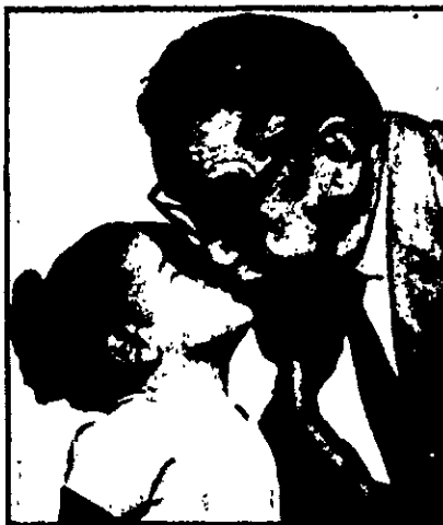
MARSHAL (RET) ARTHUR DA COSTA E SILVA